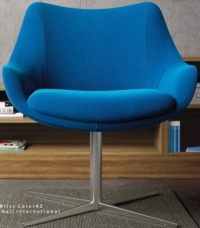
Bloom Lounge Chair appearing in Carnegie Bliss Color42 Seat Upholstery by Kimball International